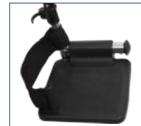
Front riggings with heel loop