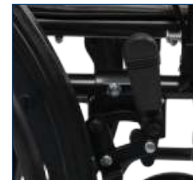
Easy-to-operate wheel locks